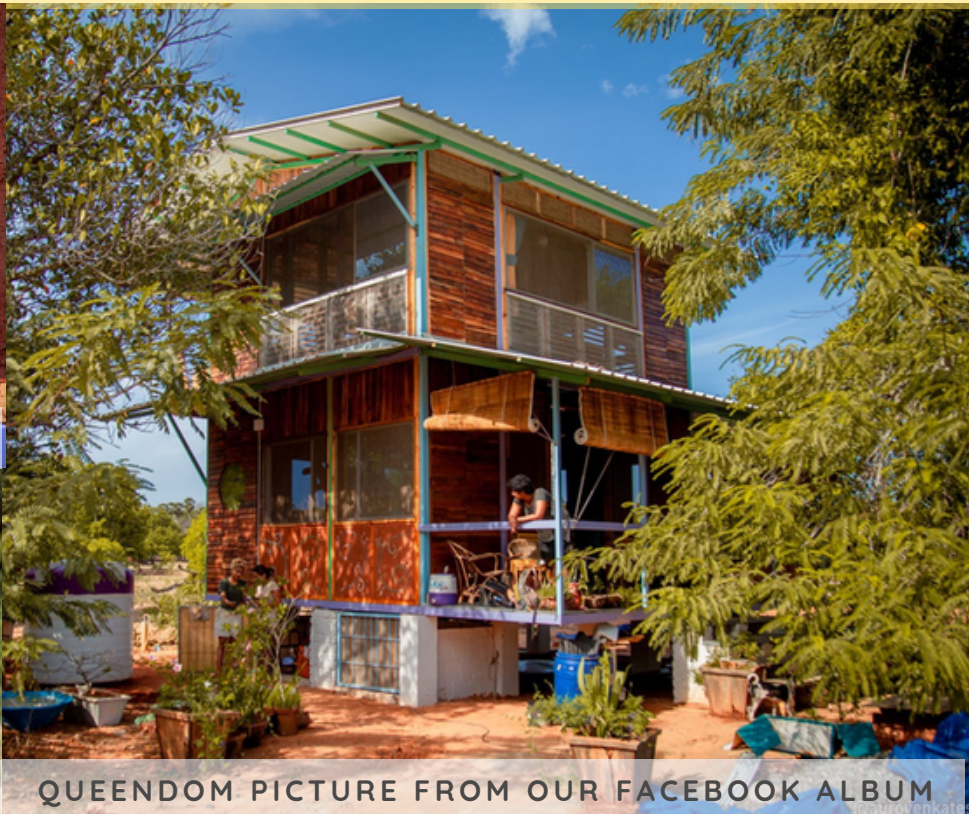
QUEENDOM PICTURE FROM OUR FACEBOOK ALBUM