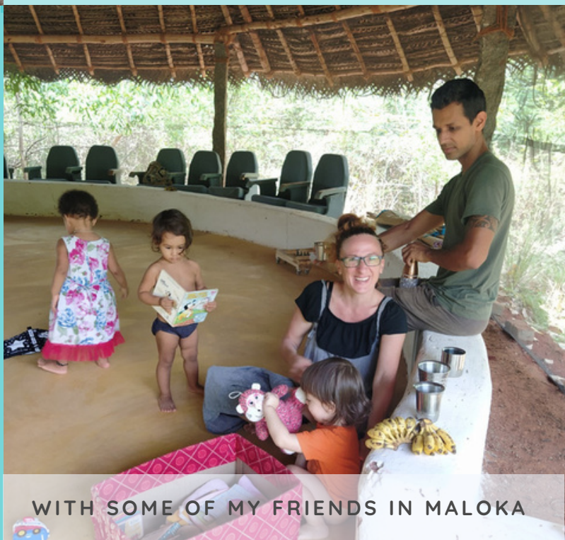
WITH SOME OF MY FRIENDS IN MALOKA

During the week-end, I help with community work in Anitya. I also go to the pool or to the beach, and I often go to community events to meet more friends... Did I tell you that I am very social? Of course, after all that, I have a good night of sleep!