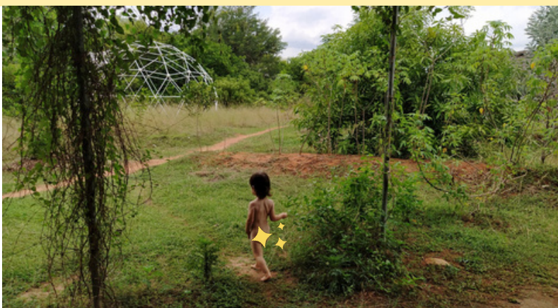
EXPLORING ANITYA IS ONE OF MY FAVORITE ACTIVITIES!