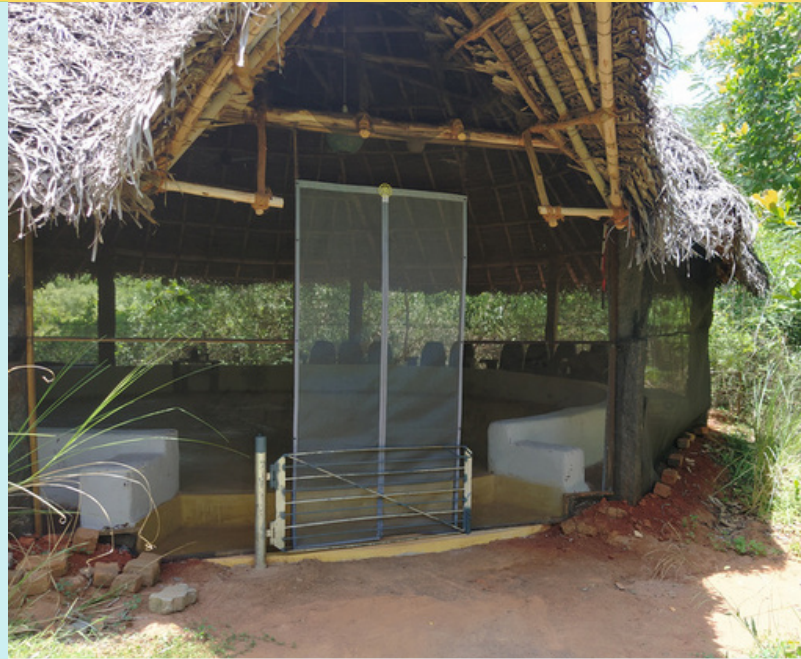
WE ARE SO GLAD TO NOW HAVE A SPACIOUS AND BEAUTIFUL PLACE

We are looking forward to bring more people, activities and life in our community!