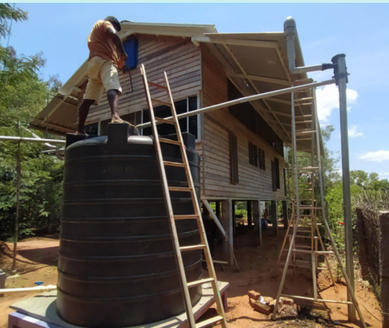
FINAL WORK TO CONNECT THE NEW TANK TO THE FILTER AND THE ROOF

We installed a new tank on a platform, a filter and a connection to the roof of the Family pod to increase our capacity: we are now able to store around 25,000 liters of water after a generous rainfall.